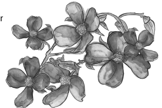
Today’s Chancel Flowers are placed to: “The Glory of God!”